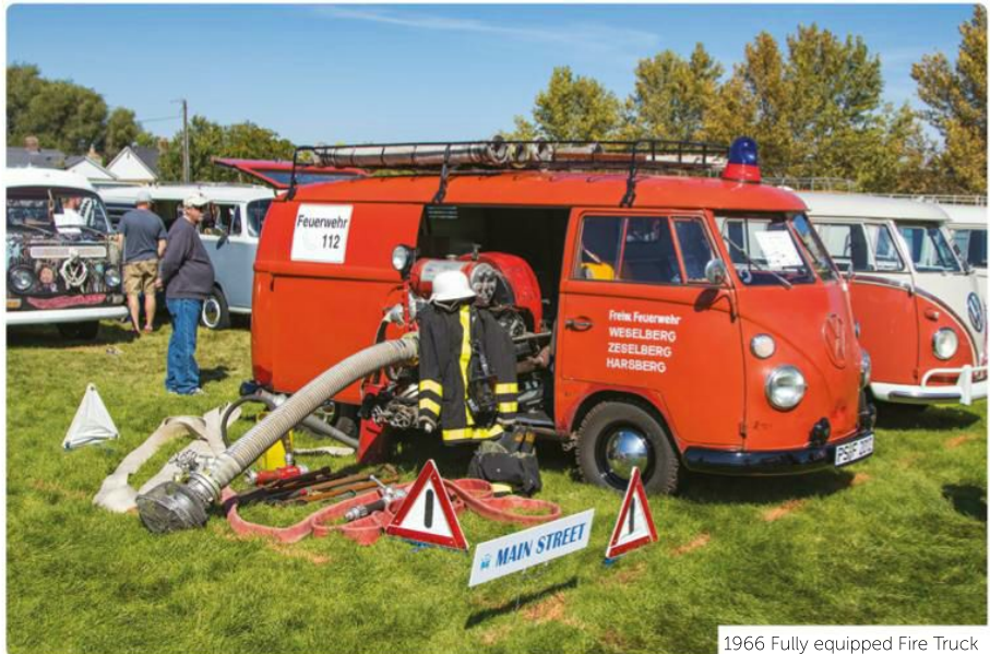
1966 Fully equipped Fire Truck

Christmas must have been uppermost in my subconscious when compiling the feature buses for this issue, as the colours of red and white seem to have taken over! Original paint, patina rat, shiny resto, brand new custom, we have the whole spectrum! A 1966 13 window Deluxe Microbus in "barn find" condition with sun-bleached paint and battle-scarred body oozes character and charm but don't be fooled by its looks! The cheekily 2WD badged T3 with raised suspension and syncro style wheel arches may look ready for rugged action but is still a "work in progress" according to its owner. Showing what's possible when the starting point is basically a rolling shell, a '73 red and white themed custom camper sports a striking interior to match its one off body colour, whilst at the opposite end of the spectrum is a brand new T6 Weekender, fitted with a Rolling Homes bespoke interior designed round a state of the art ICE equipment. A former Early Bay